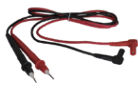
Test Lead Kit 1 pc.