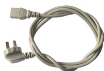
power cord 1 pc.